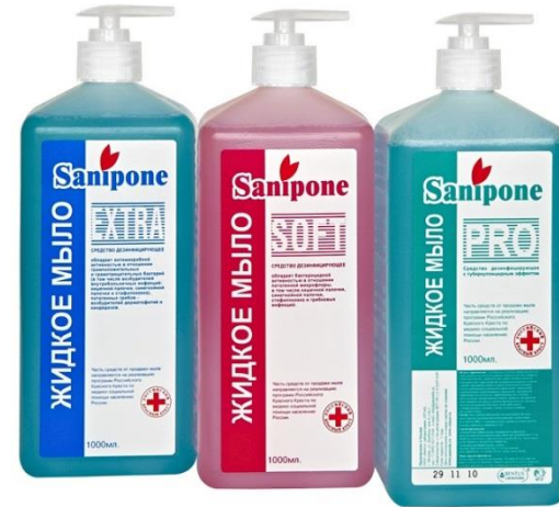
Sanipone™ antibacterial liquid soap.