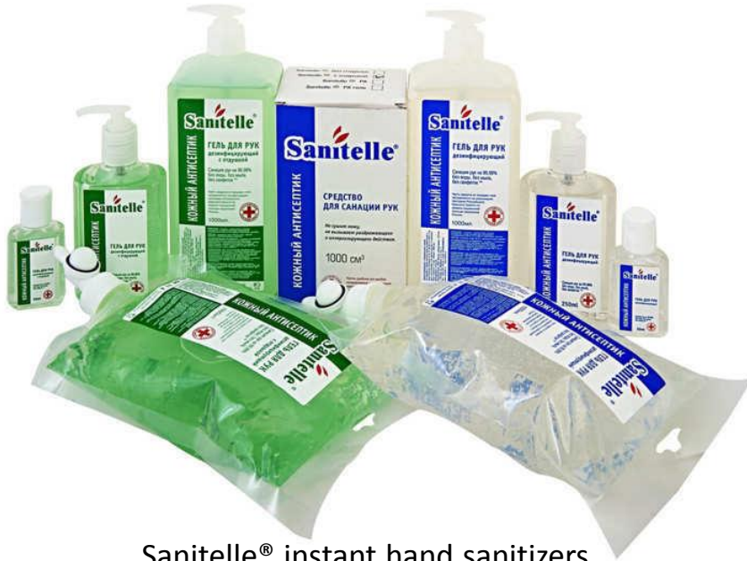
Sanitelle® instant hand sanitizers.