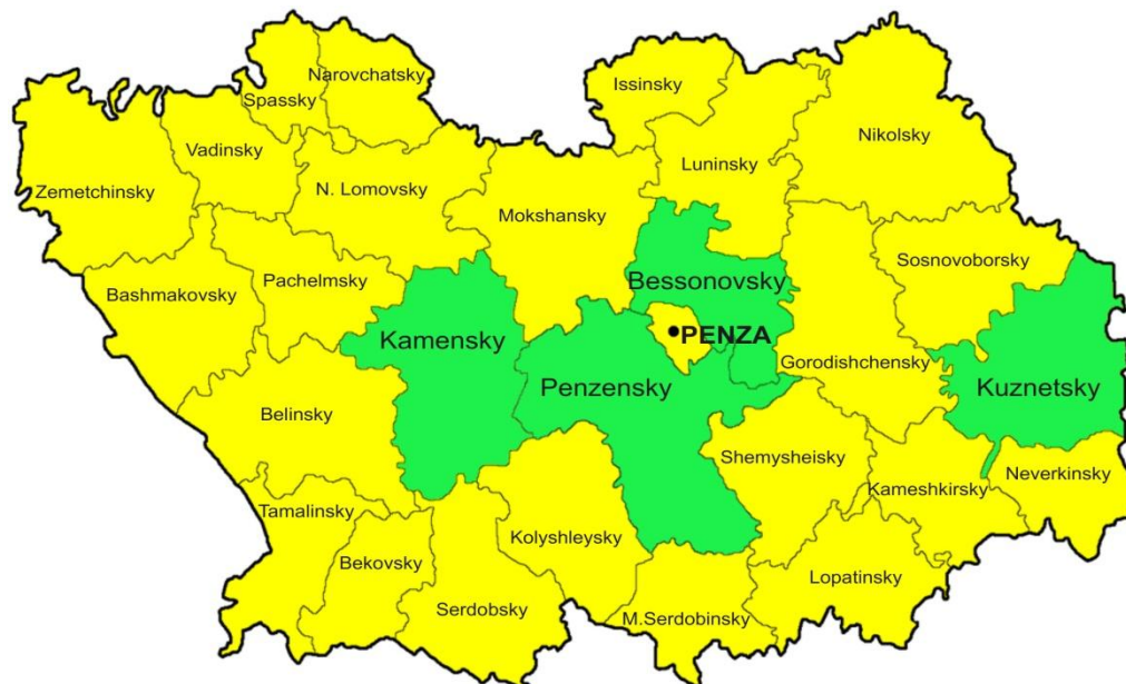
Pic.1 Map of the Penza region

Serdobsky district is situated in the South-Western part of the region occupies an area of 169 508 hectares and the district borders with Saratov region on the South.