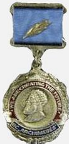
The silver order "For Creativity"