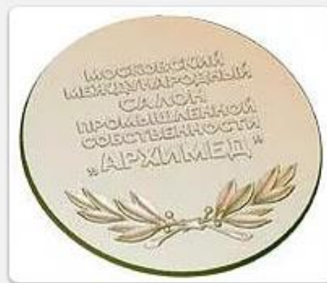
The silver medal of the International Salon "Archimedes"