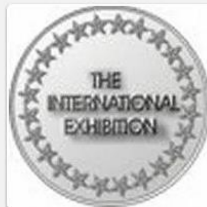
The silver medal of exhibition-presentation "The trade mark - LEADER"