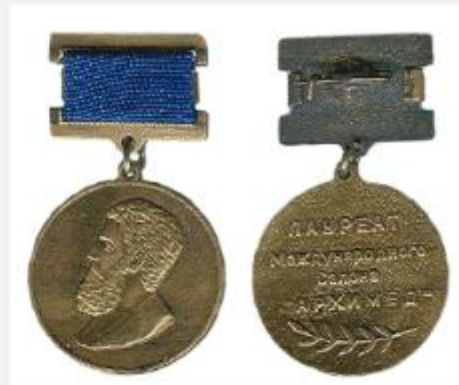
The winner of the International Salon "Archimedes"