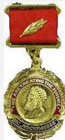
The gold order "For Creativity"