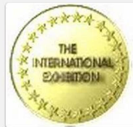
The gold medal of exhibition-presentation "The trade mark - LEADER"