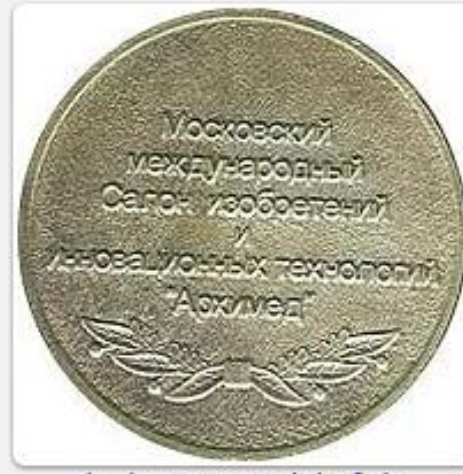
The bronze medal of the International Salon "Archimedes"