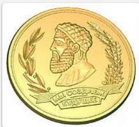
The gold medal of the International Salon "Archimedes"