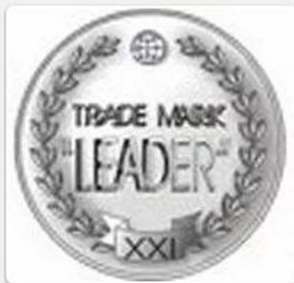
The silver medal of exhibition-presentation "The trade mark - LEADER"