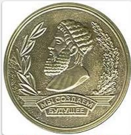
The bronze medal of the International Salon "Archimedes"