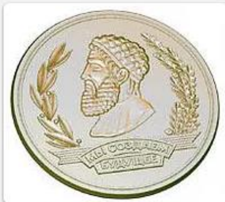
The silver medal of the International Salon "Archimedes"