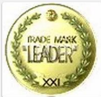
The gold medal of exhibition-presentation "The trade mark - LEADER"