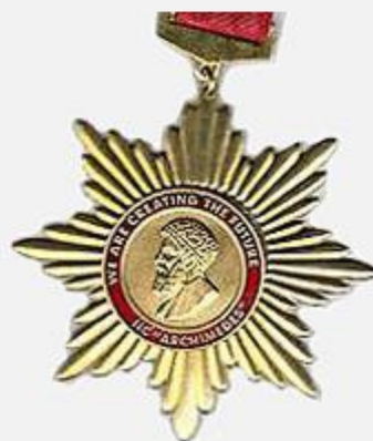
The order Grand Gold "Archimedes"