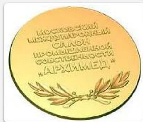
The gold medal of the International Salon "Archimedes"